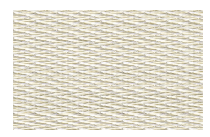
EGGSHELL WHITE SC-TB6-102