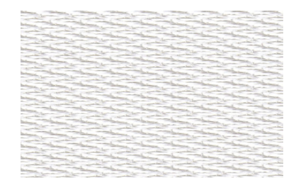
WHITE SWAN SC-TB6-101