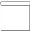
RO LLER SH AD ES