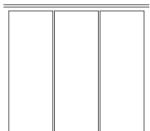
PA NE L TR AC KS