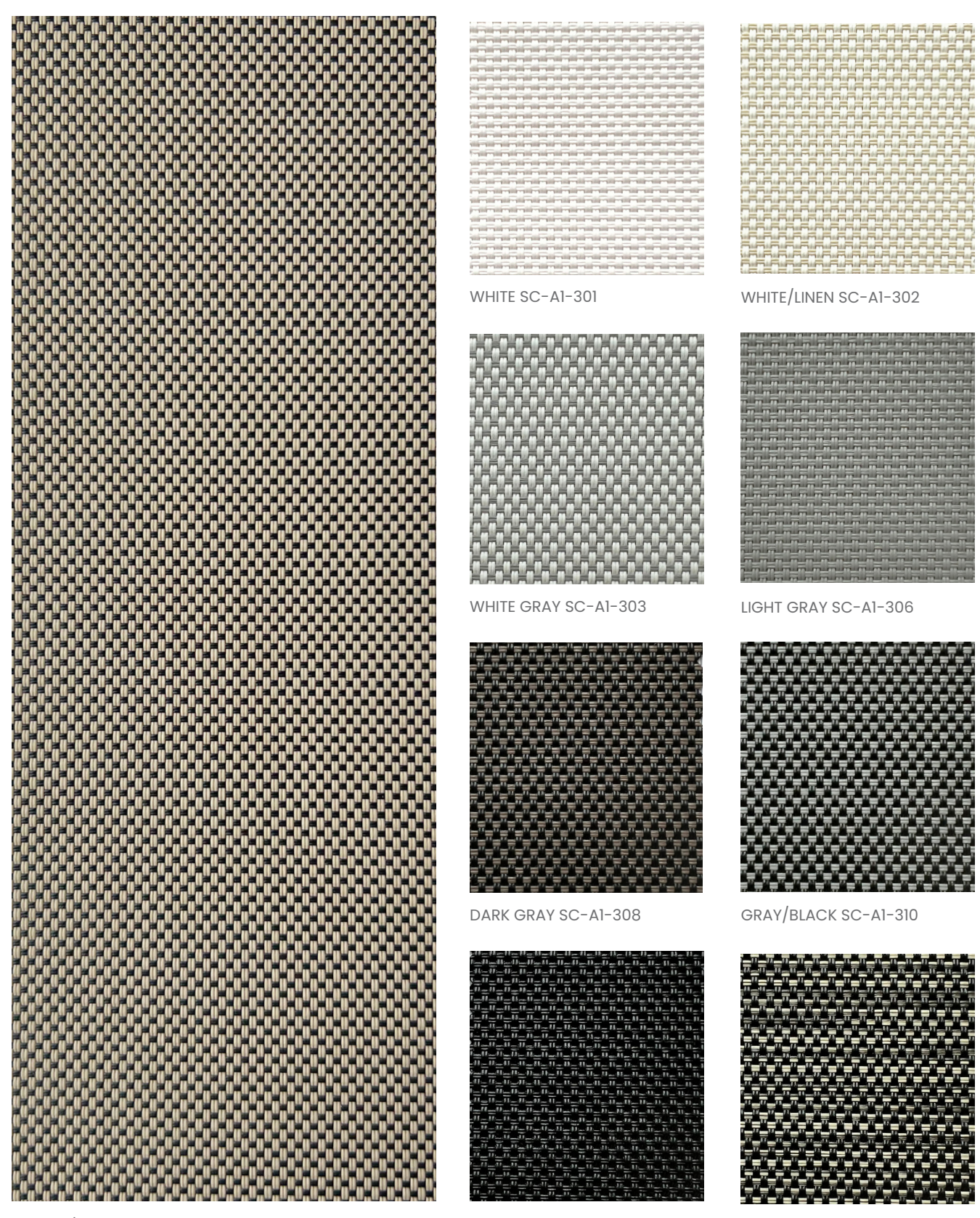
BROWN/TAUPE SC-A1-312 BLACK SC-A1-311 CHARCOAL TAUPE SC-A1-313