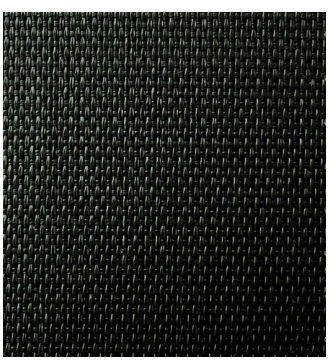
DARK GRAY SC-E1-608